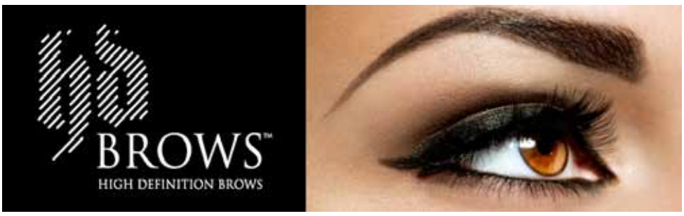
*Patch test required 24hrs prior to treatment